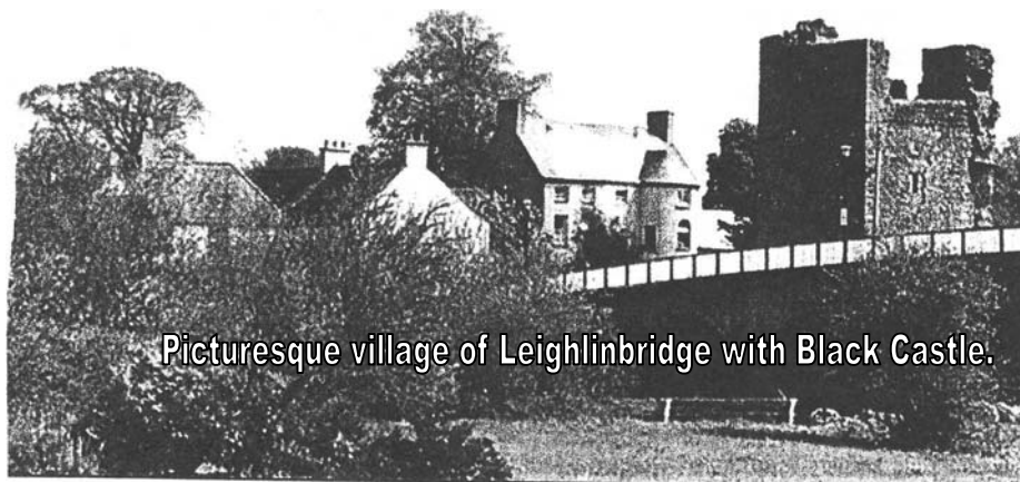
Picturesque village of Leighlinbridge with Black Castle.

Our Millennium gathering is in Leighlinbridge where you can soak in the atmosphere of this quiet, riverside village in the well known Lord Bagenal Inn. The Lord Bagenal has developed a reputation for fine food and excellent value for money. The menu offers a wide selection of fresh seafood in season and the restaurant has won many national and international awards.